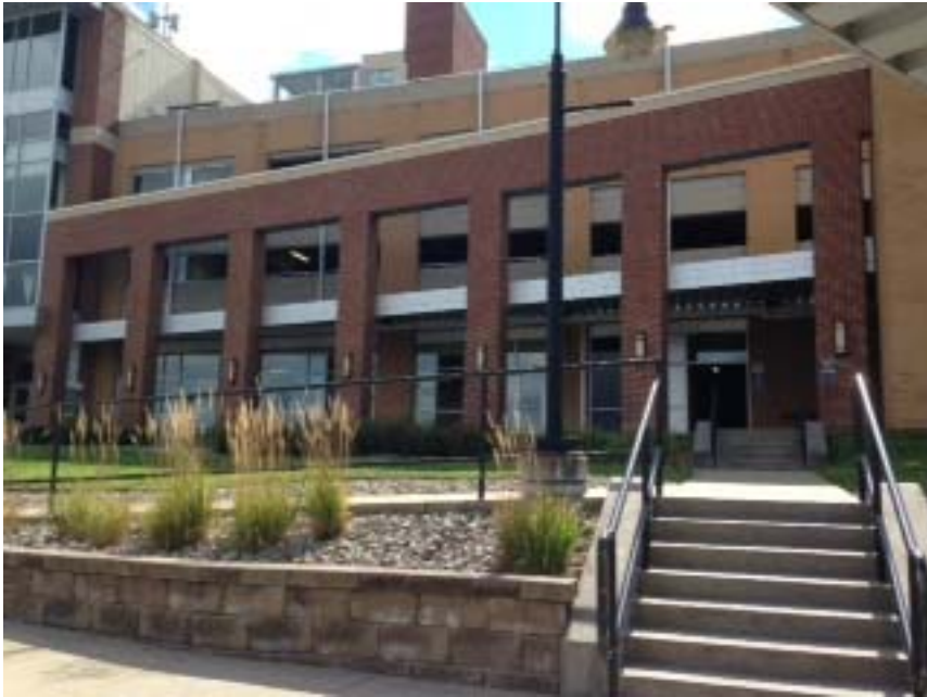
See the entrance to the building in the far distance.