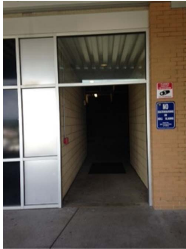
Proceed through this entrance and turn left.