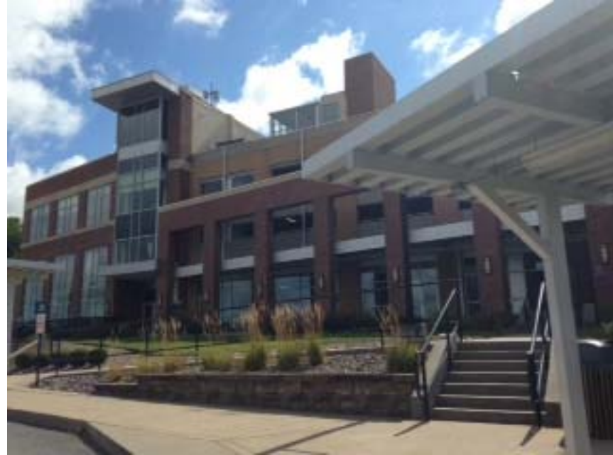
If you park in area 81 after normal business hours (Monday through Friday), you need to walk up the steps near the bus stop area and walk straight ahead to the open entrance. You can also take the ramp around to this area.