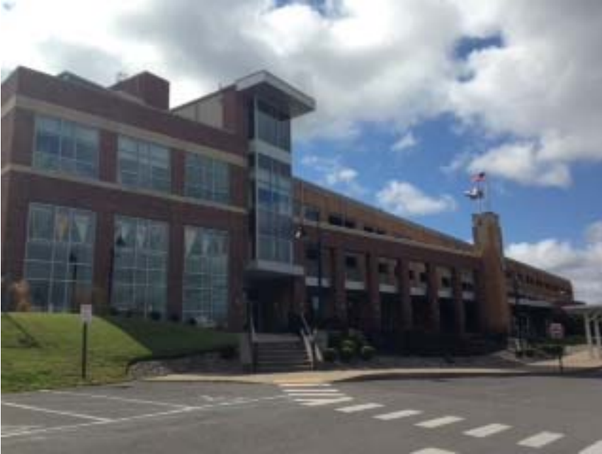
WVU Parking and Transportation Building – Area 86-Mountaineer Station Garage is attached to this building; Area 81 paved parking lot is located here also.